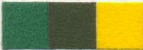
emerald green Ω bottle green primrose Ω