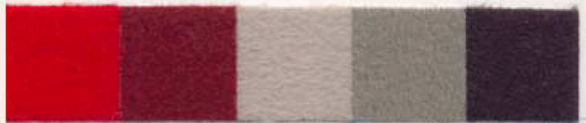
cherry red Ω burgundy new silver grey dove Ω black Ω