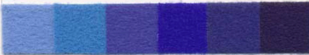
wedgewood blue blueberry cornflower royal blue Ω regal blue BA navy