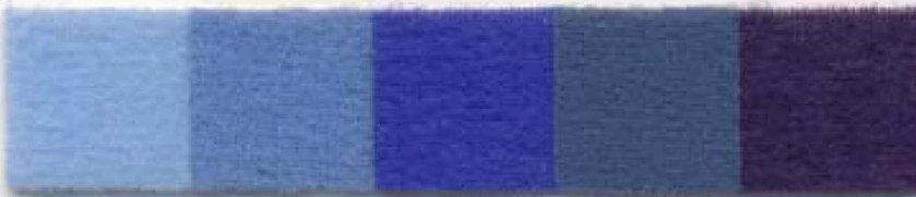
hyacinth pacific medici Ω steel blue ink navy